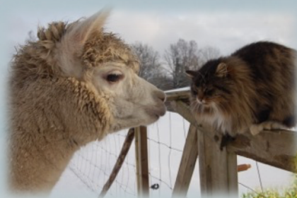
Brencis & Sofie