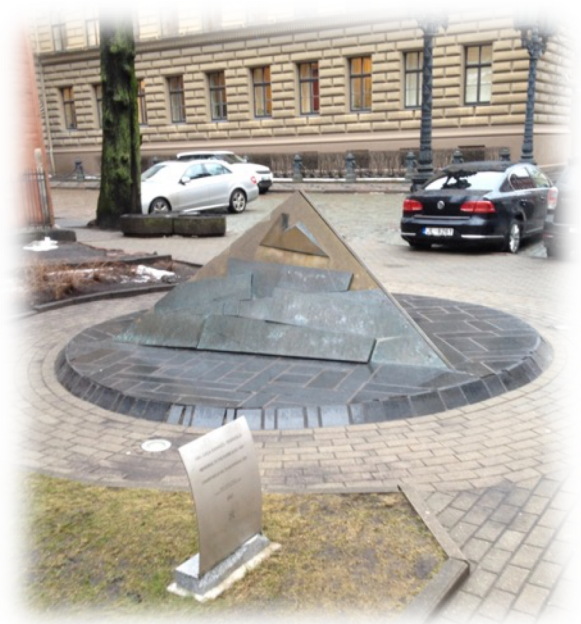
Memorial to the barricades of 1991 erected to deter the Soviet army from regaining control

Latvia has come a long way from its Soviet past and you will find many facilities up to European standards, especially nearer to Riga. Ergli itself is a rural village with basic facilities and not yet geared up for tourists but our hotel is pleasant with friendly staff and plenty of choice for breakfasts. There are two lovely bakeries in the village and supermarkets, but no souvenir shops. We will, however, ensure that you get to see local crafts and culture and taste local foods along the way. Latvians can still be shy of sharing their knowledge and culture with outsiders and so this is an evolving programme where we work with Latvians to develop the presentation of their skills. This means our programme takes time to develop over the year and final details will be available on arrival. However, we assure you of a holiday with a difference, in a warm and inviting atmosphere for those who are prepared to be adaptable. Whether you are an experienced traveller or wanting to branch out for the first time, Joanna, Ian and Heather will be there to look after you. All transport within Latvia, food and accommodation are included in the price of £1 250 (initial deposit of £500 to secure your place). However, if you wish to experience more of Riga and its wealth of activities, shops and museums we suggest arriving a few days earlier or staying on after the trip.