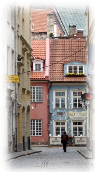
Riga Old Town